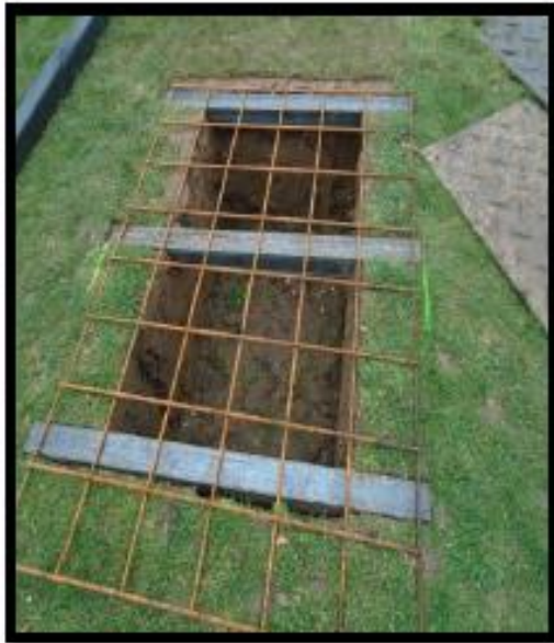
Tubular Supports and Grid