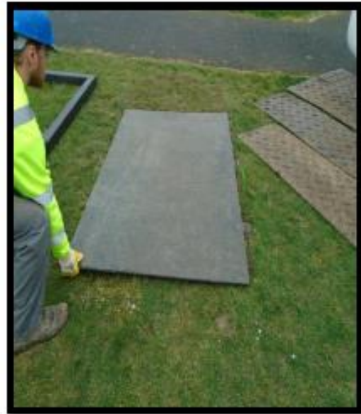
Heavy Duty Plastic Board